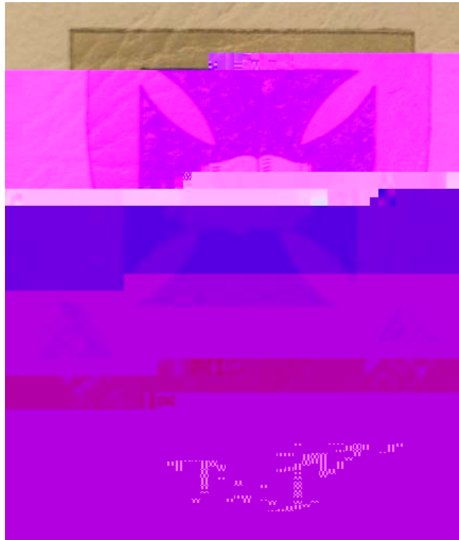
The coat of arms designed by F. W. Robinson in 1940.