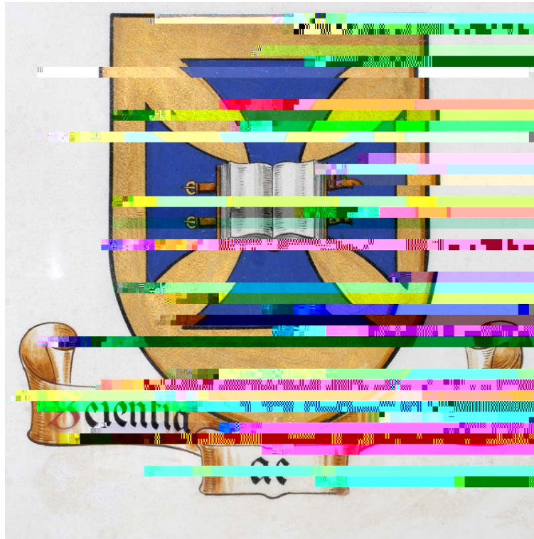
The original coat of arms as granted by the Herald's College